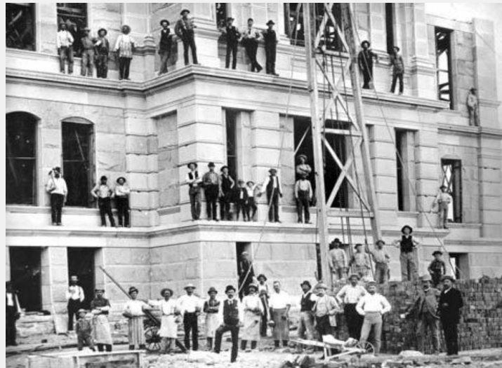
Workers stand on the ground and on different levels during construction of the Wyoming Capitol in 1889.

THE OFFICIAL NEWSLETTER OF BLUE CROSS BLUE SHIELD OF WYOMING FOR LARGE EMPLOYERS