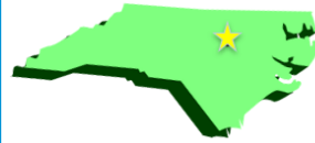
North Carolina: Telemedicine Location